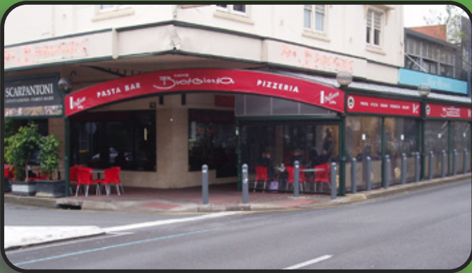
Outdoor Dining Protection